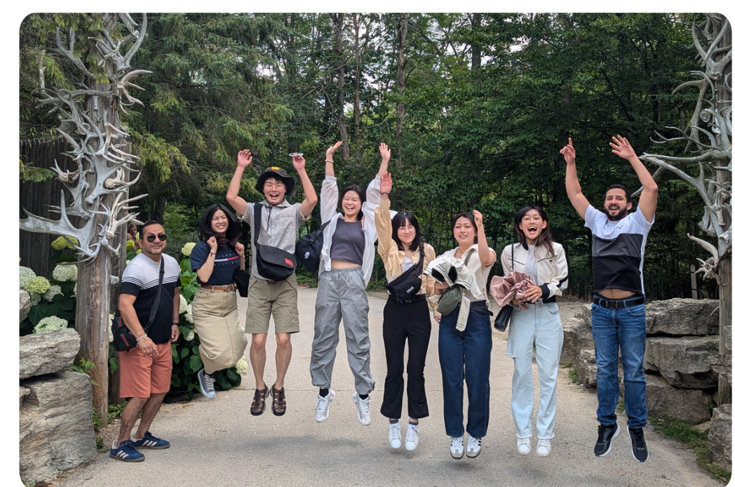
Students jump under the antler arch at the NEW Zoo!